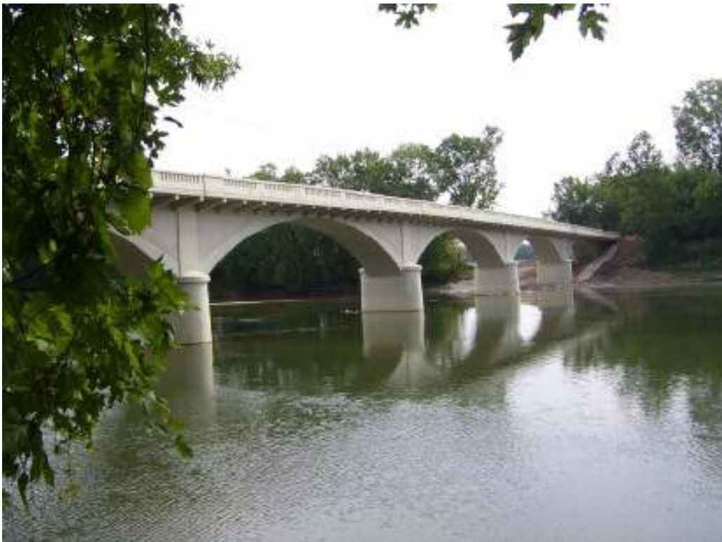
The bridge was dedicated and the canal sites recognized in ceremonies on June 15.

Also receiving an award were the Carroll County Commissioners who were honored for recognizing the historic value and monetary savings of preserving – rather than replacing – the 1927 Carrollton Bridge over the Wabash River. That bridge site also is important to Wabash & Erie Canal history. At one end of the bridge are the sites of Lock #32 and the Mentzer Tavern, a popular stop-off for canal travelers.